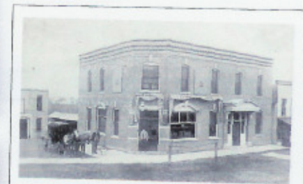
The Hartland Inn, previously the Commercial Hotel 1913 / Present