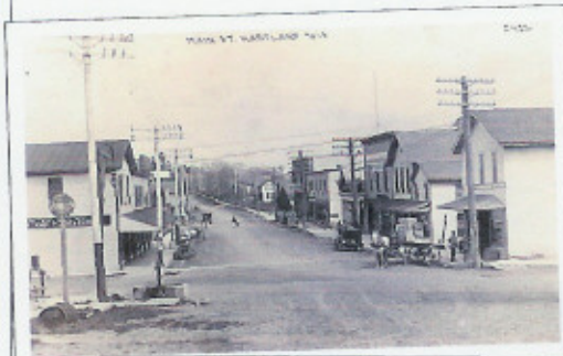
Looking east onto Capitol Drive from Hill Street. 1913 / Present